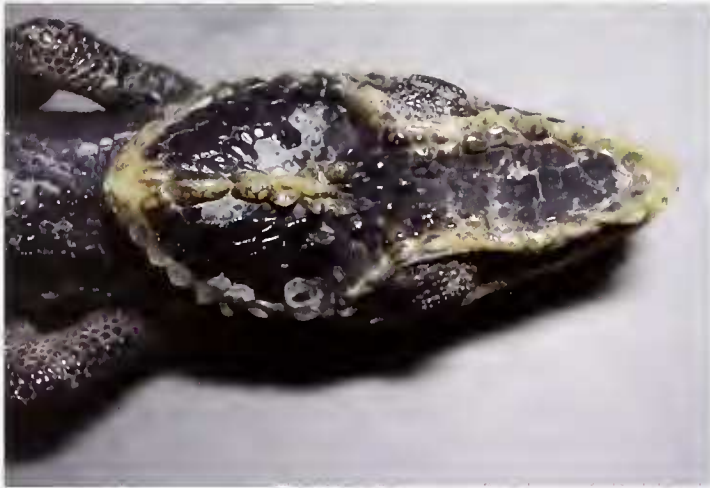
Fig. 1. Head view of the holotype of K. u. uthmoelleri.

moelleri at these locations have not been confirmed. Recently the taxon uthmoelleri was placed with all other east African Bradypodion in a new genus, Kinyongia (Tilbury et al. 2006). In the last 15 years only two authors have published details on the captive husbandry and breeding of K. uthmoelleri , specimens collected from the Ngorongoro crater highlands (Price 1996; Necas & Nagy 2009). Around the year 2000, specimens of “ Bradypodion uthmoelleri ” appeared in the international pet trade. These animals were very small in overall size, more slender and with smoother scalation than K. uthmoelleri specimens from Mt. Hanang. Even after six years of keeping some of these specimens in captivity these distinct characters have not changed and so ontogenetic change in these characters can be ruled out. Unfortunately, the geographic origin of these specimens was not known until four similar specimens were discovered in the collection of the Muséum d’histoire naturelle in Geneva in 2004, which suggests they originate from the same locality, the South Pare Mountains, and belong to the new subspecies described in this paper.